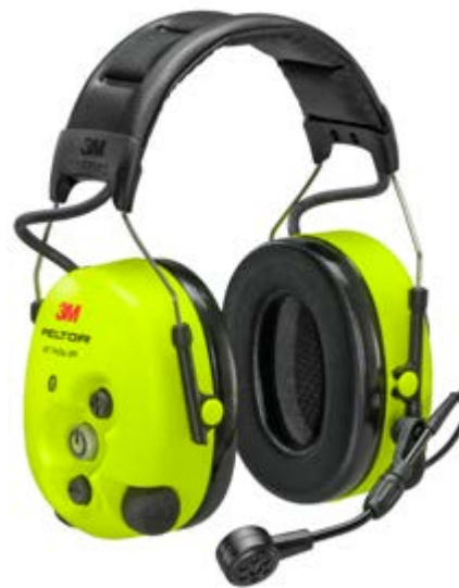
Headband MT15H7AWS6 / MT15H7AWS6-111