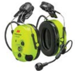
Helmet Attach MT15H7P3EWS6 / MT15H7P3EWS6-111